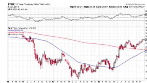
10-Year Treasury Note Yield, dated January 3, 2014